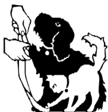
A: ACS LOGO