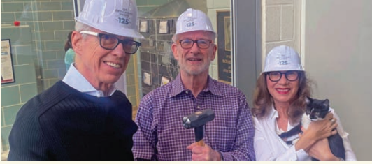
Keep reading to see a lasting legacy of love in action!