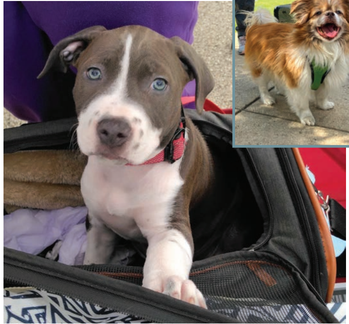
You deliver essential services to pets who might otherwise go without them!

That's when the pup slipped her collar and escaped. Before she could set off on her quest for adventure, a staff member caught her and returned her safely to her owner.