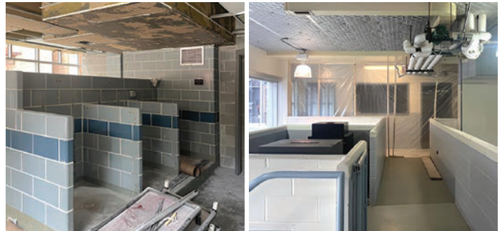
We can't wait to see the animals enjoy the upgraded spaces you've made possible!

Thank you for helping create an even more enriching shelter experience for animals in need. We're putting the finishing touches on these new and improved spaces, and we can't wait for you to see the results of your compassion. 🐾