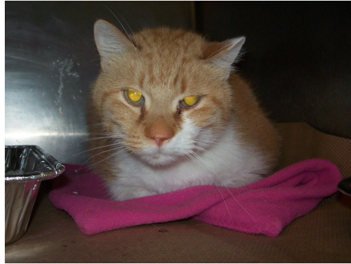
Corie, an 8 year old orange tabby enjoys his new bed in Rehab