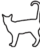
C: CAT OUTLINE