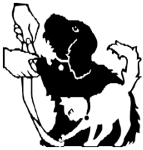
A: ACS LOGO