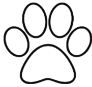
B: PAW PRINT